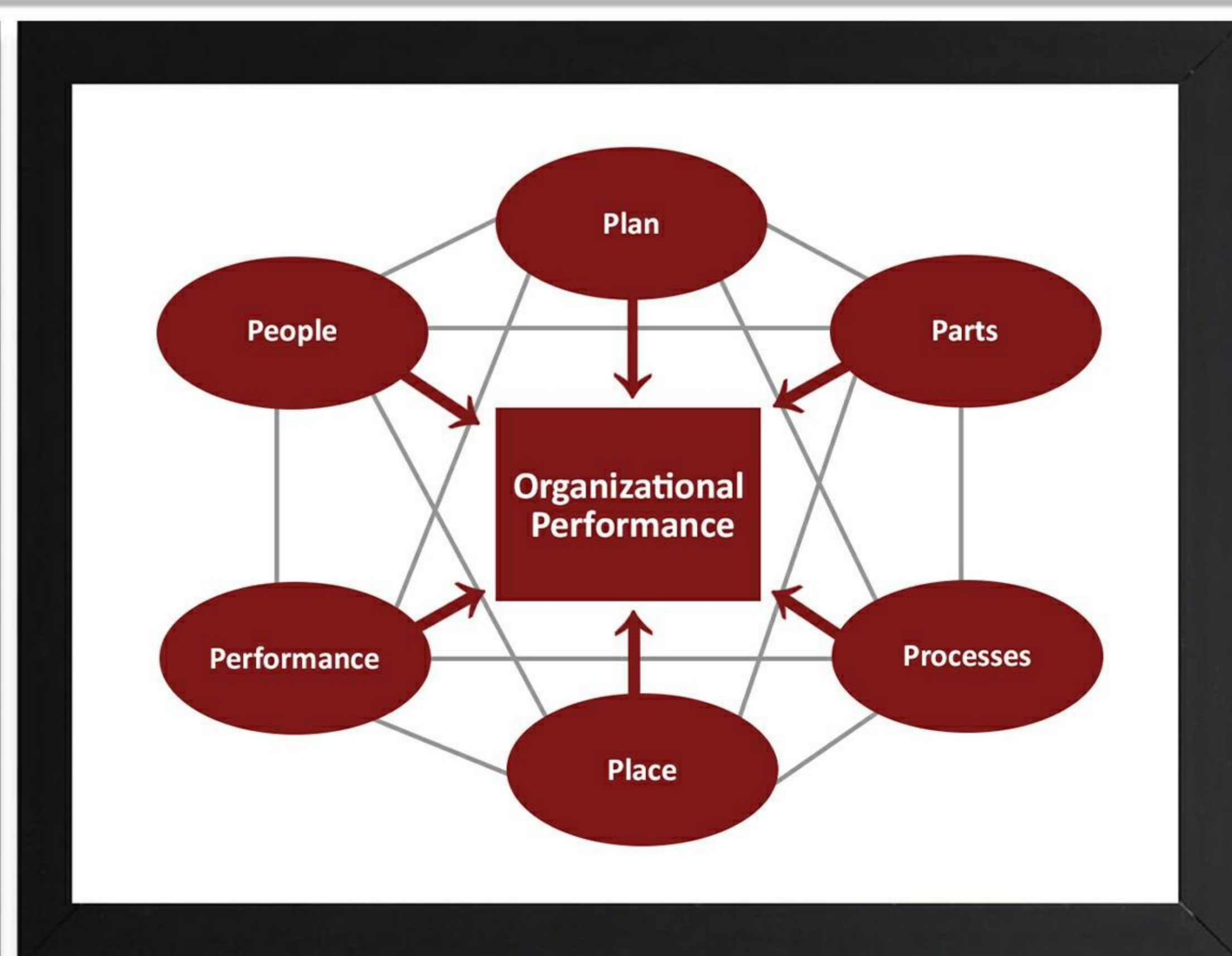
Image: Framework of OPL