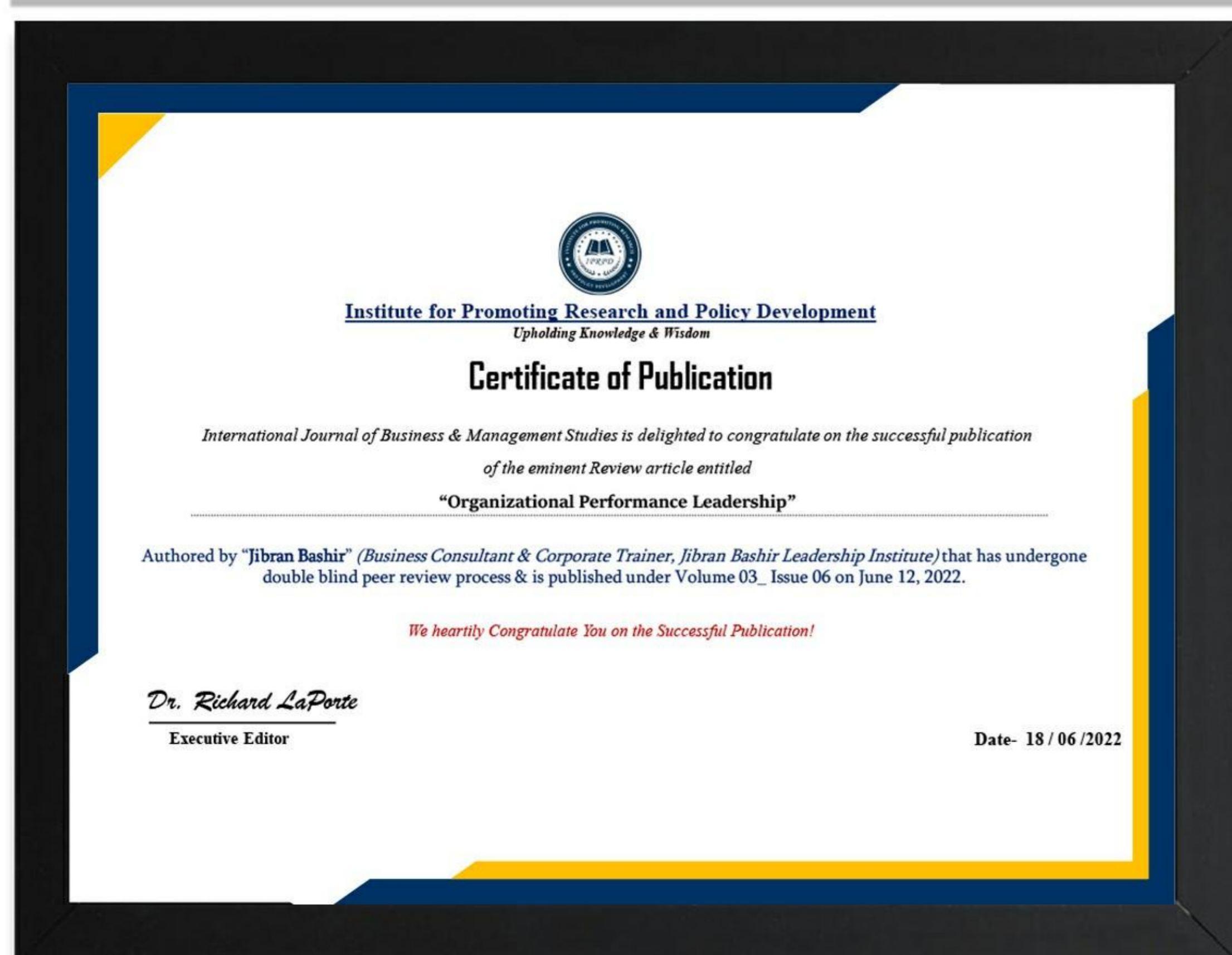
Image: Certificate of Publication

The framework was published in 2022 in the International Journal of Business & Management Studies, titled "Organizational Performance Leadership (An Integrated Approach to Build and Maintain the Whole Organization for Its Peak Performance)."